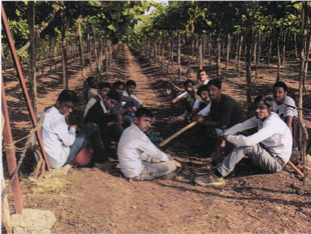
Students are showing for visiting and awareness about organic farming of grapes & yard.