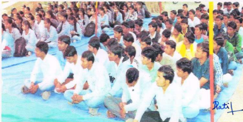
Students attending the Practical demonstration on Disaster Management

NSS Programme Officer Arts, Science and Commerce College Ozar (Mig), Tal. Niphad, Dist. Nashik