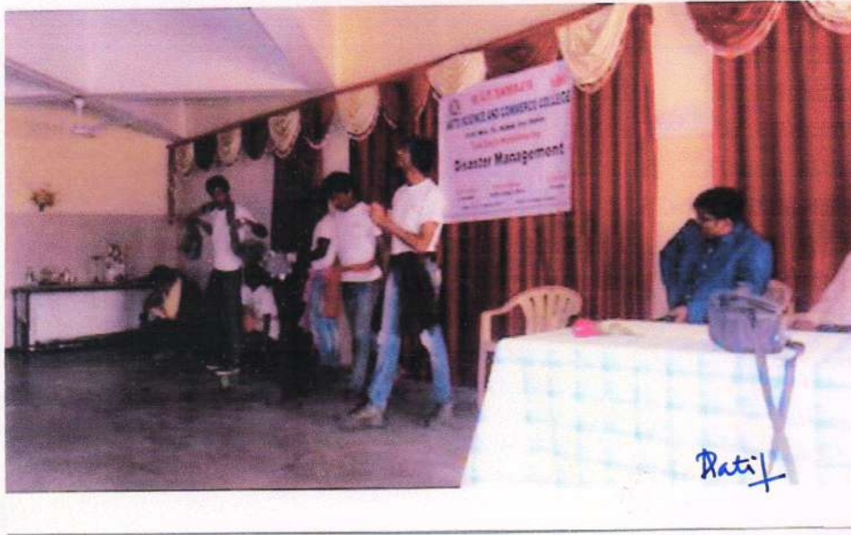
Home guard department by means of Drama, giving practical demonstration to tackle the Situation during Disaster