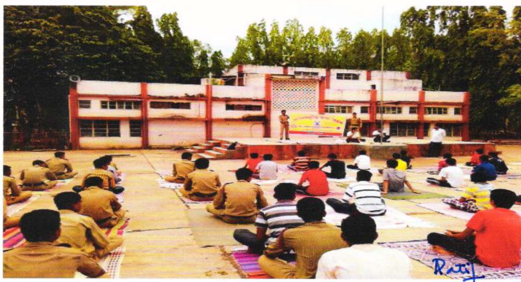
NCC Cadets performing Yogasanas on account of International Yoga day