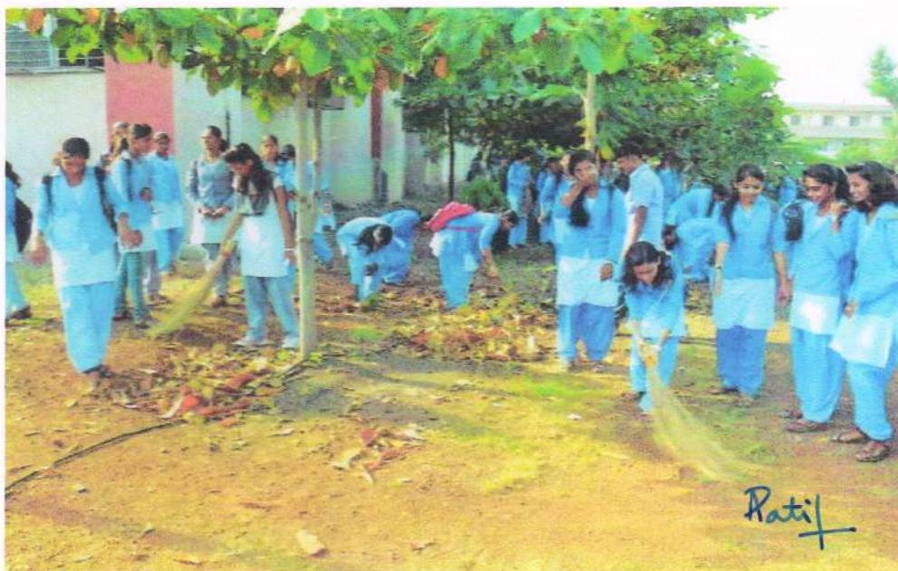
On occasion of NSS foundation day, NSS Volunteer's are cleaning the College campus