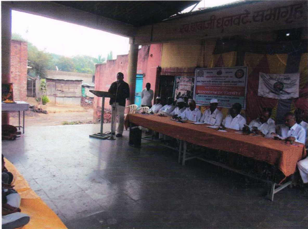
Principal Bhoj Janata Vidhyalaya Sukena, spoke on the “Significance of Eternal cleanliness and External Cleanliness”