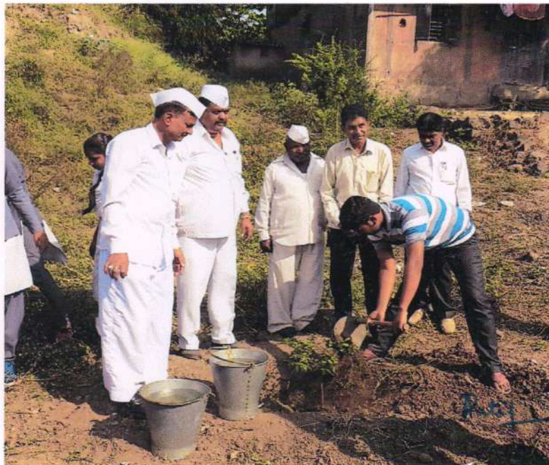
Villagers along with the Students from college engrossed in Tree plantation activity.