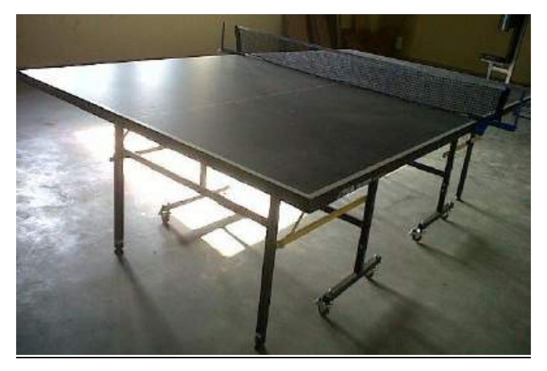
Table Tennis Table -01