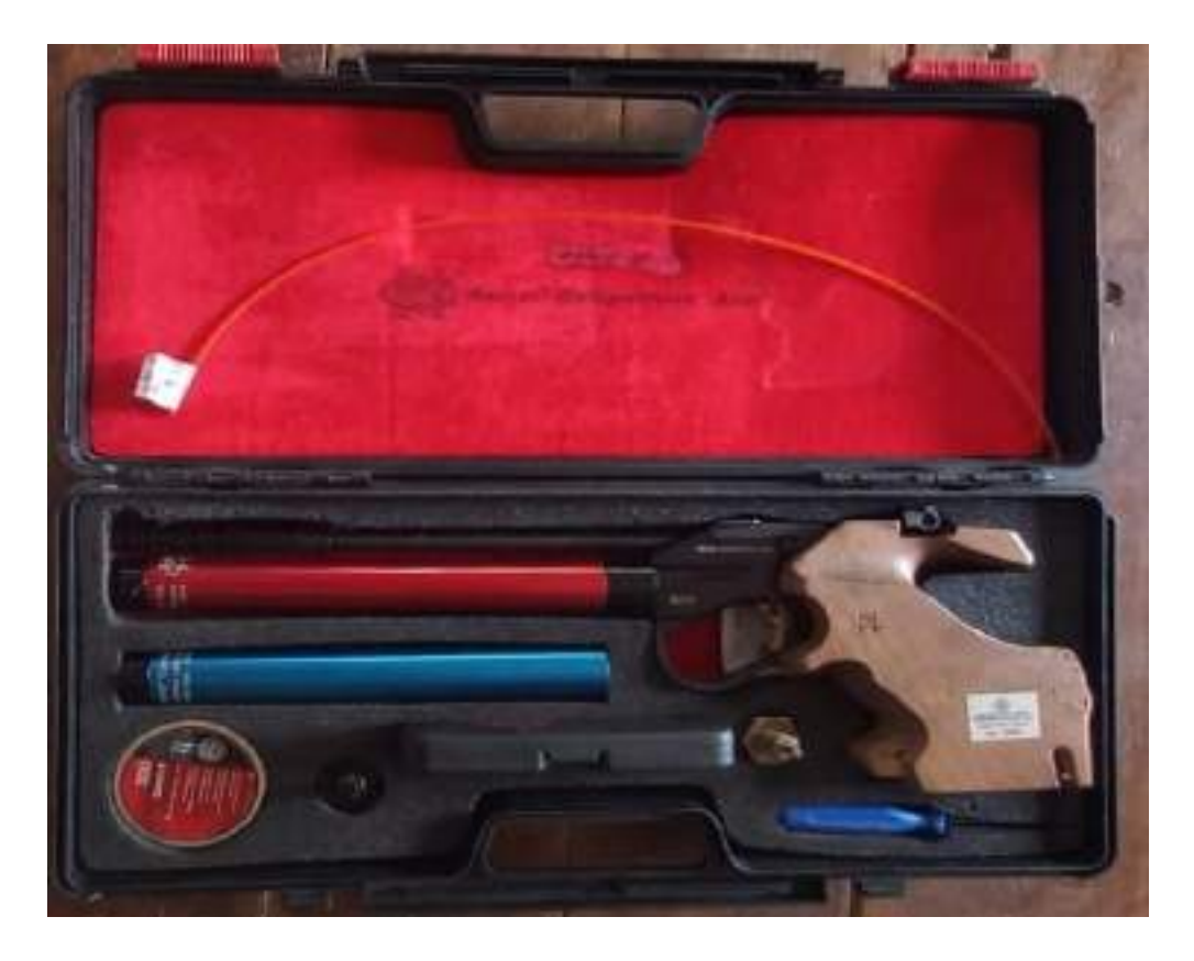
International Weapon: 10 Meter Air Pistol