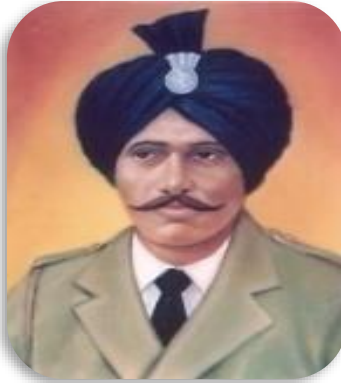
Karmaveer D.R. Bhosale